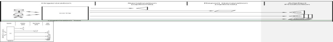
Figure 2. Generic NDR processes to create validation artefacts

Designers (and implementers) may choose to adopt other, optional processes to produce additional artefacts. For example, the serialization of the information bundle (as a CCTS model) into a form suitable for further processing or the production of reports useful in the design and review of the model. See Appendix C, (informative) Additional production processes for more details.