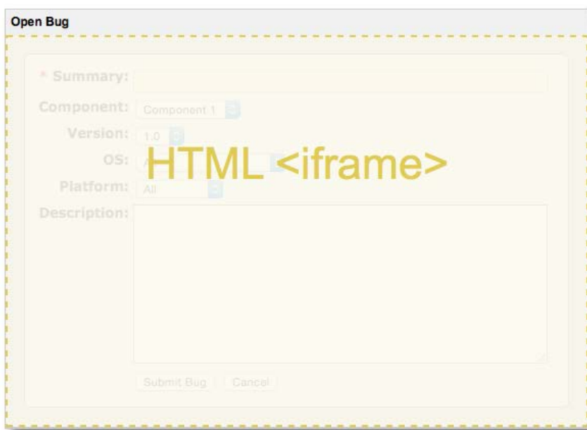
Fig. 2 Dialog iframe

Clients might choose to place dialogs inside page elements styled to look like a dialog window.