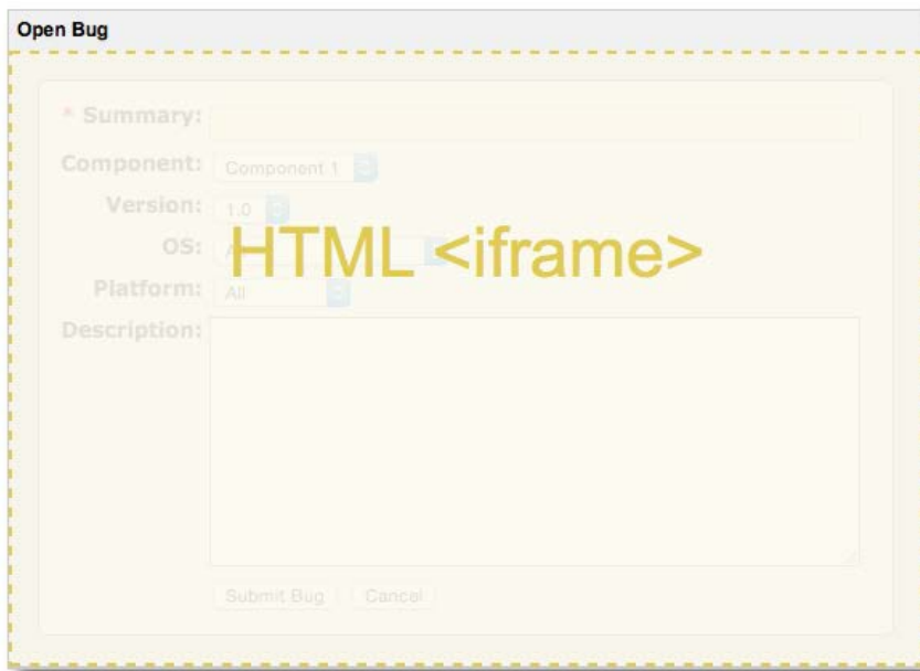
Fig. 2 Dialog iframe

Clients might choose to place dialogs inside page elements styled to look like a dialog window.